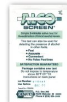
Alcohol Saliva Tester